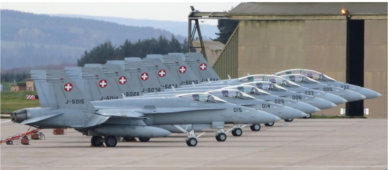
Line-up of Swiss-AF F/A-18C- and D-models. Cracks recently found in it's flaps area made the Swiss AF to on short notice cancel the popular 2019 'Axalp'-demonstration public event.