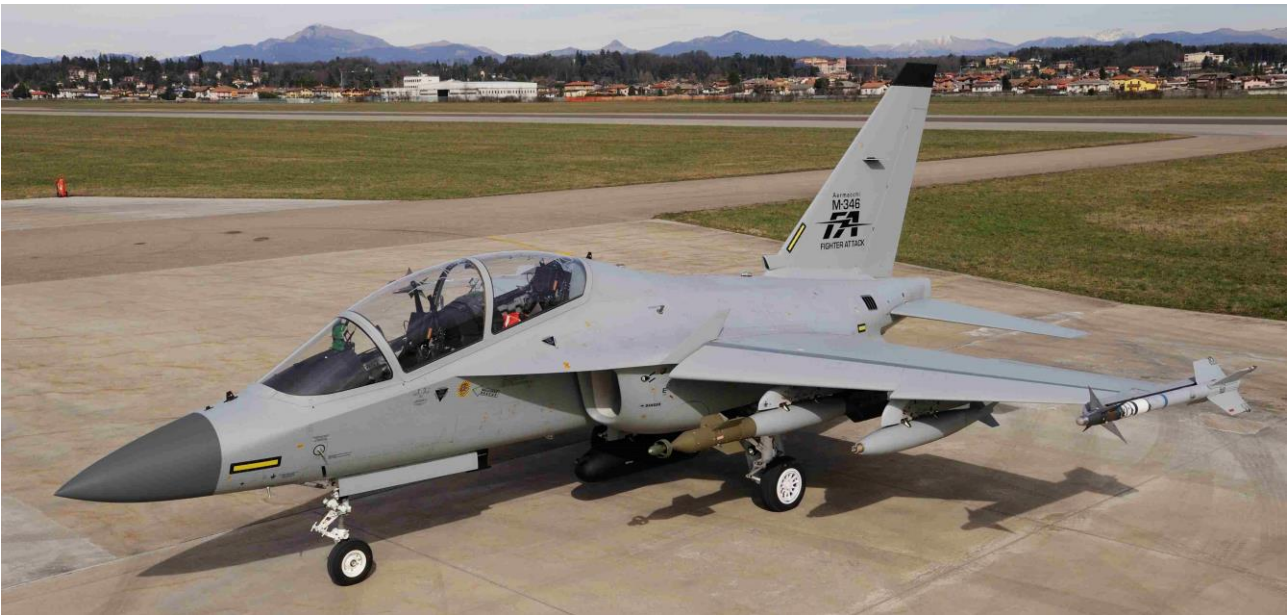
The first pre-series test airframe of weaponized M-346FA at the Venegono plant

On 8 April, the Federal Department of Defence, Civil Protection, and Sport and the Armasuisse defence procurement agency began in-country evaluations at Payerne airbase of the Eurofighter Typhoon T3, Rafale F4, F-18E/F Super Hornet, and F-35A Lightning II to replace F-5E and F/A-18C/D fighters with a single type with a full operational capability in 2030. Armasuisse recommended that the Gripen E not participate. An assessment report and final vote in the National Council is planned for 20 December, triggering the countdown to the mandatory referendum the SP is counting on.